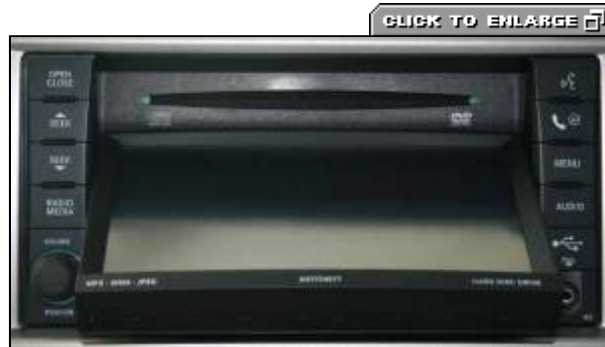
HIGH-TECH FIRST: Chrysler SA has introduced MyGIG, a multimedia infotainment system that can include satnav and a reversing camera, across three of its brands.