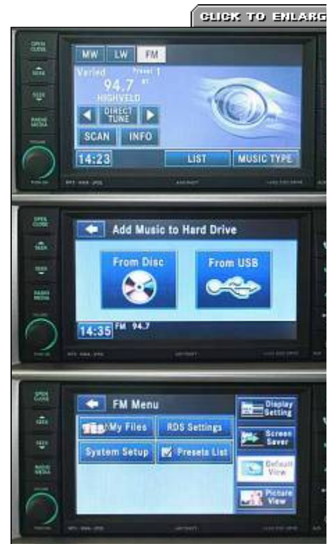
CHOICE IS YOURS: Chrysler's new MyGIG infotainment system offers a number of touch screen facilities that can be run with voice commands.