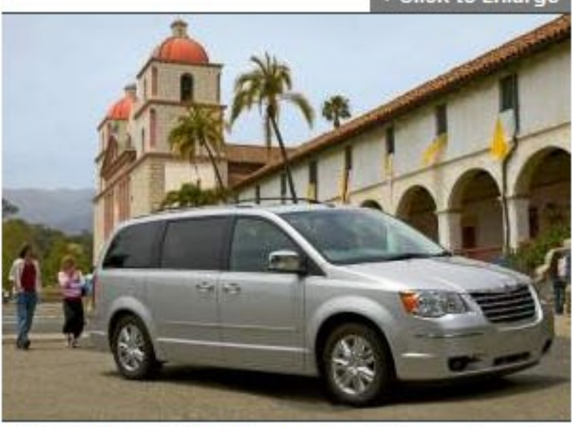
CLEARLY CHRYSLER: The new Grand Voyager shows its family resemblance to the 300C.

GRAND VOYAGER HAS ALL THE COMFORTS OF HOME