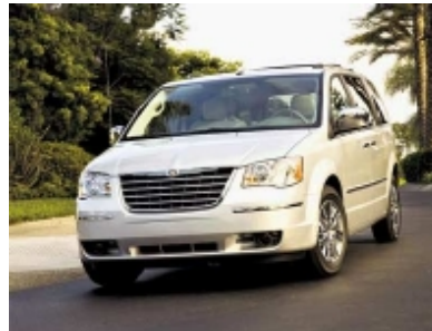
UNUSUAL: The Grand Voyager boasts 30 new features.

Chrysler have gone big on the infotainment capabilities of the vehicle. It is possible for passengers in the second row to watch different movies to those in the third row or to play games while those in the back row watch movies.